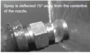
Spray is deflected 75° away from the centerline of the nozzle.