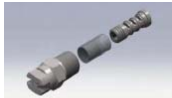
Available with strainer assembly.